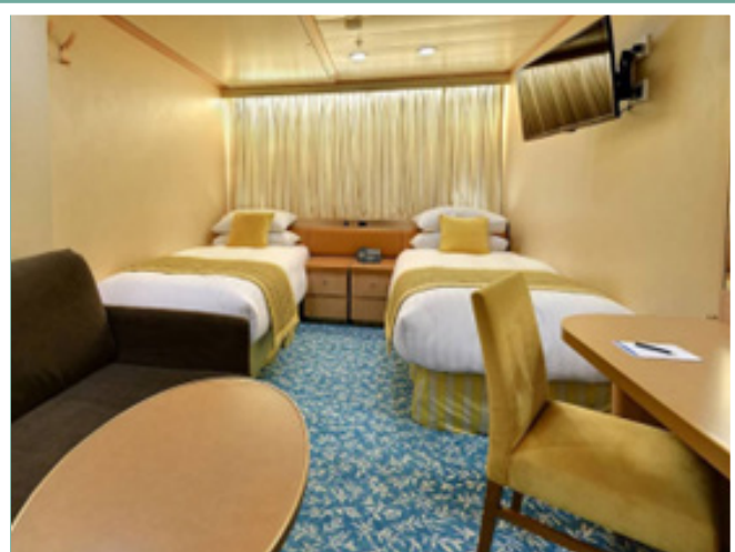
INTERIOR ROOM (H)