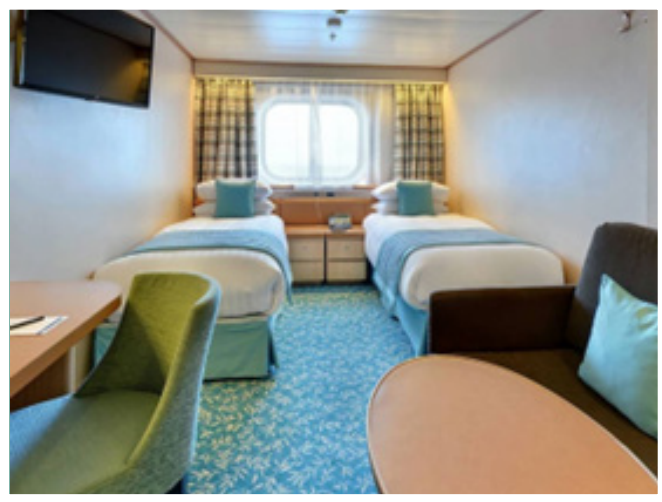
OCEAN VIEW (D)