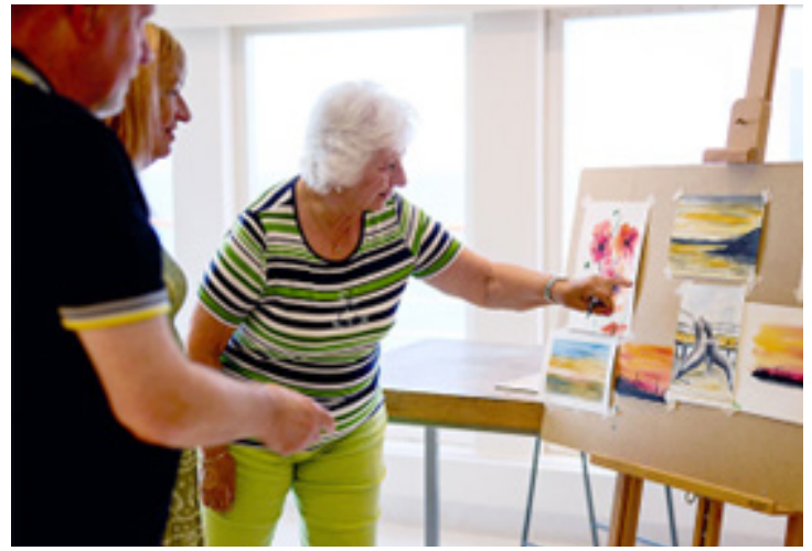
The Olsen Art Studio on board where your quilt workshops will be conducted